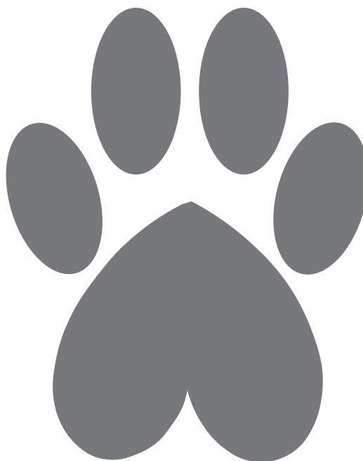
Cat Paw Print Appliqué Template, Actual Size